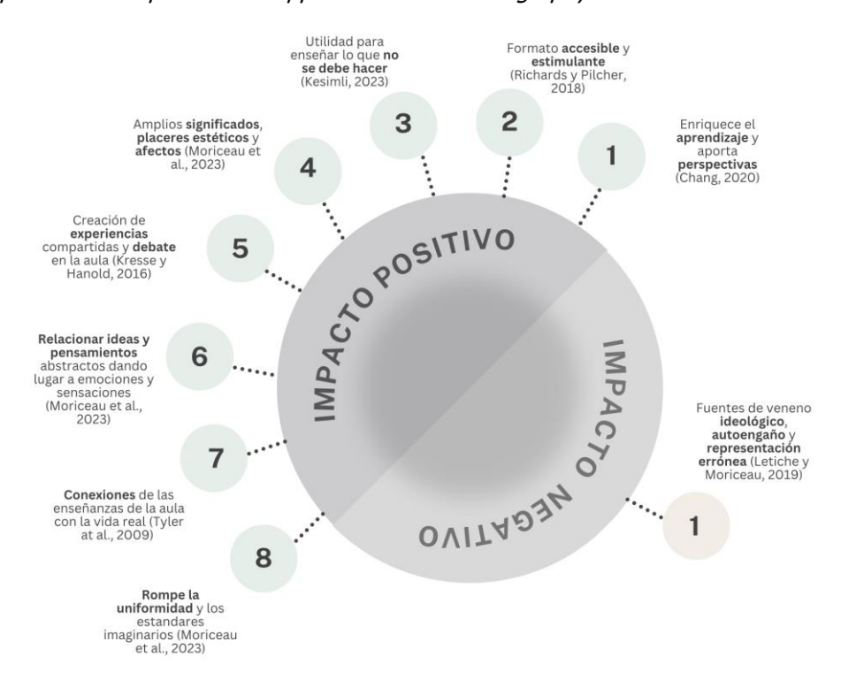
Figure 1 Infographic on the impact on the application of cinematography in classrooms.