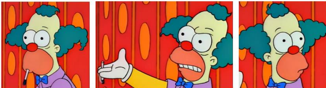
Figure 8 Krusty's emotional reactions after the broadcast of Worker and Parasite