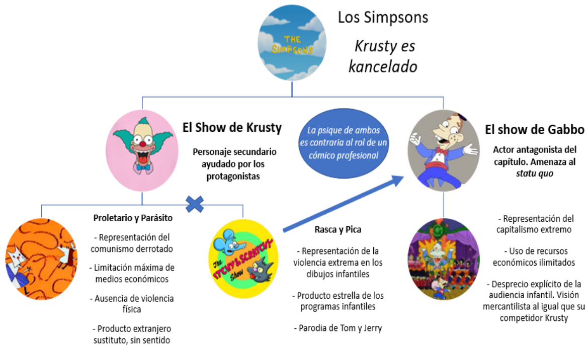
Figure 1 Concept map of the episode Krusty Gets Kancelled