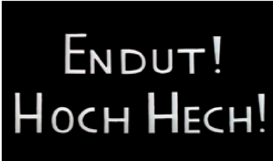
Figure 7 End credits of Worker and Parasite