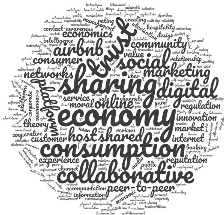
Picture 1: TERMS used in the keywords of the articles discussed.

out on the website https://www.nubedepalabras.es/ , the most used are economy (9.09% of the total), sharing (8.16%), consumption (3.03%), collaborative (2.56%), trust (2.56%), digital (1.86%) and social (1.86%). The priority use of these words corresponds to the three fields of study considered for the carrying out of this research -a) collaborative economy and collaborative consumption , b) trust and reputation and c) Internet , e-commerce , online , digital and web -. The rest of the terms found appear less than 1.4% of the time.