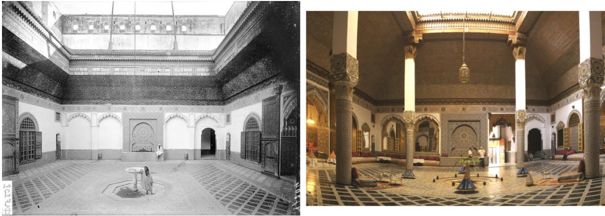
Images 1 y 2. Dar Mnebli Palace, Fez, Morocco. 1. Izd.: Pierre Dieulefils (1914); 2. Right: José Muñoz (2009).