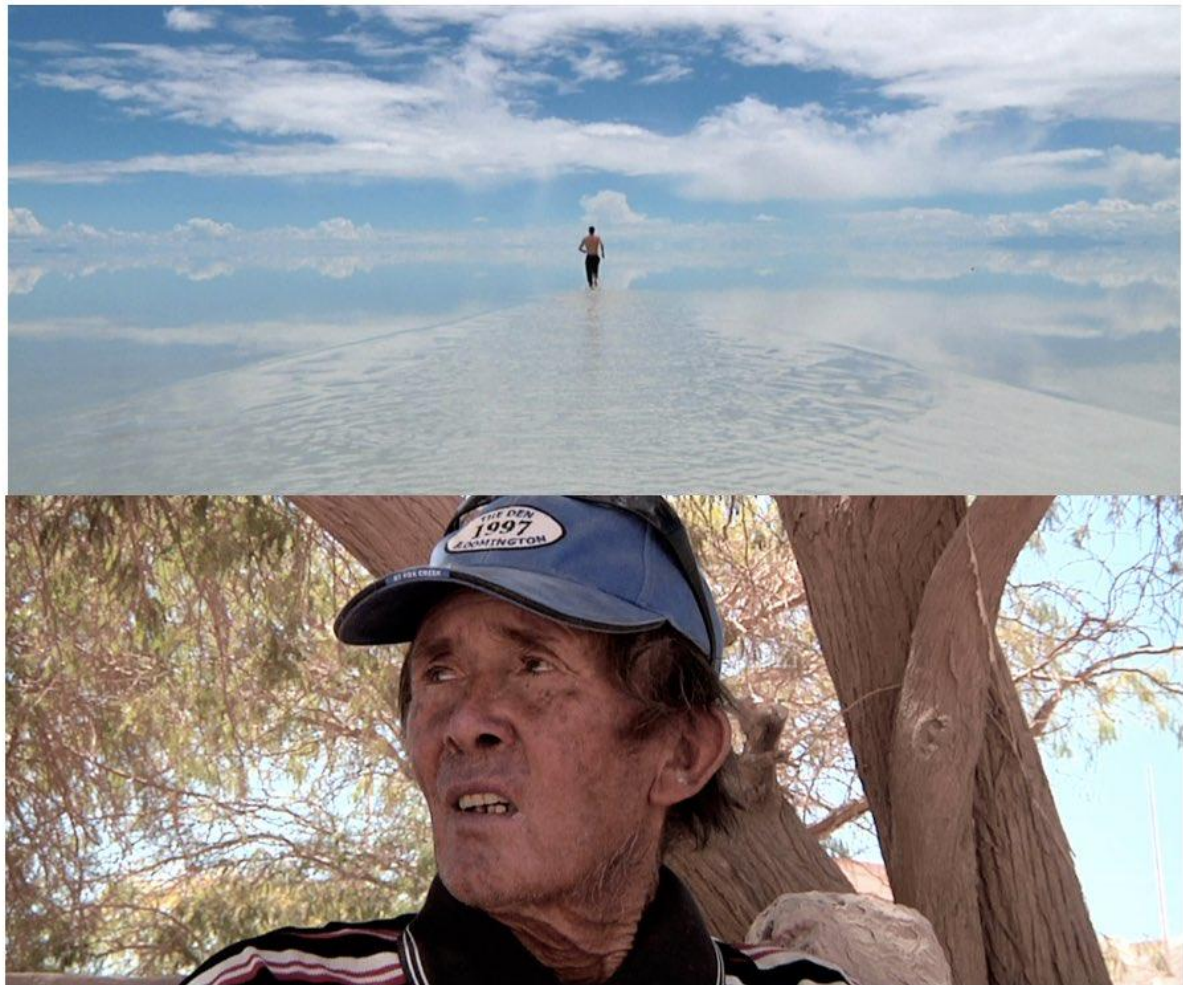
Image 2: Photographs of the final locations of Radio Atacama : Uyuni Salt Flat (Bolivia) and Pedro de Valdivia (Chile).